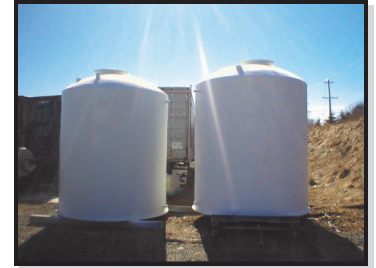
Standard Vertical tanks waiting for fittings to be installed

We work closely with our customers to assess their needs and the performance requirements for the tanks. We then prepare a virtual 3D model from which we produce our detailed shop drawings. Matching the fabrication materials to the design and layup schedules, we provide the highest standard of quality for each tank we build. With the latest equipment and workmanship of our fully trained production staff we build our tanks to meet or exceeded our customers expectations.