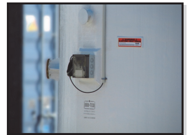
Insulated tank with Heat trace controller option