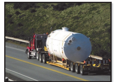
Oversize load going to the port of Halifax for overseas destination